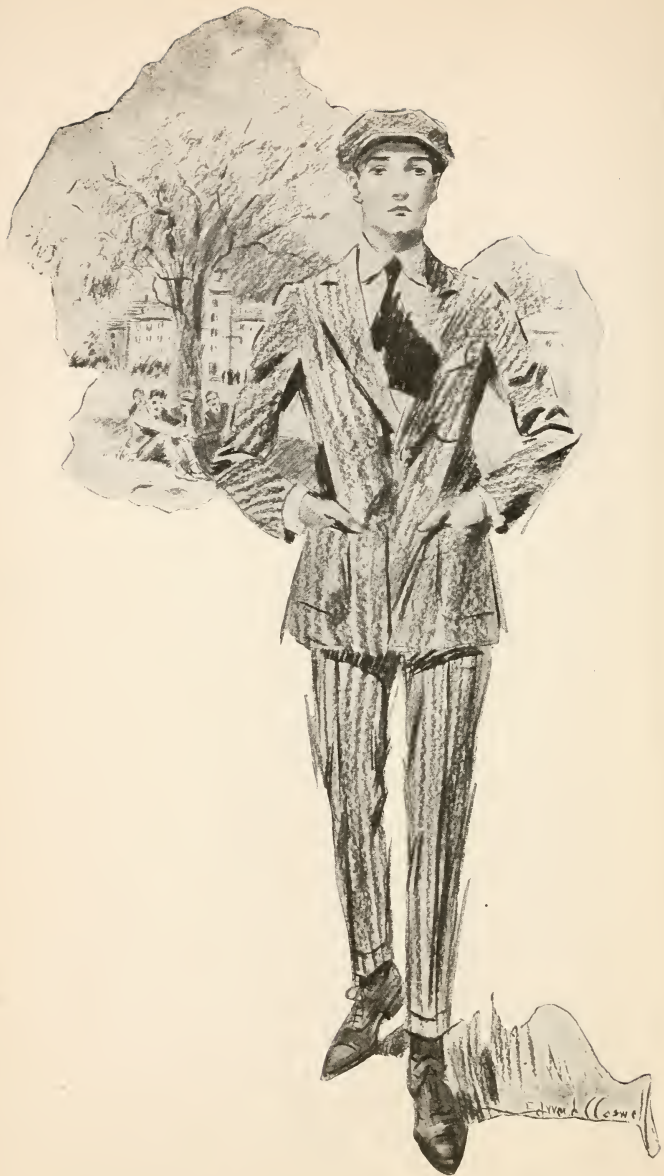
He felt that he was being discussed Page 29